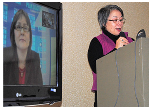
Nunavut MP Leona Aglukkaq, left, appeared via video for a press conference with Nunavut Premier and Education Minister Eva Aariak in Iqaluit on Feb. 14 to announce Nunavut schools will have access to a larger bandwidth starting this spring.

The bandwidth at the territory's 43 schools will triple this spring under the Classroom Connect project, from the current 7.5 megabits per second to some 21 megabits per second, announced both levels of government. The increased bandwidth will translate into faster and more reliable connections to the Internet and enable video-conferencing, for instance, something Nunavut MP Leona Aglukkaq took advantage of as the weather prevented her from traveling to Iqaluit for the announcement.