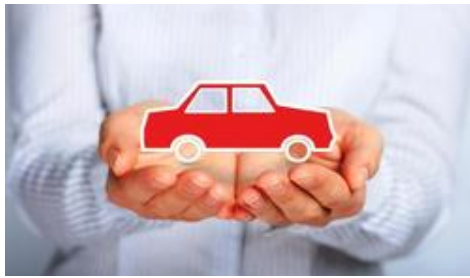
Best Car Insurance Companies