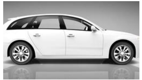
Best Rated Small SUV