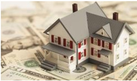
Best Mortgage Lenders