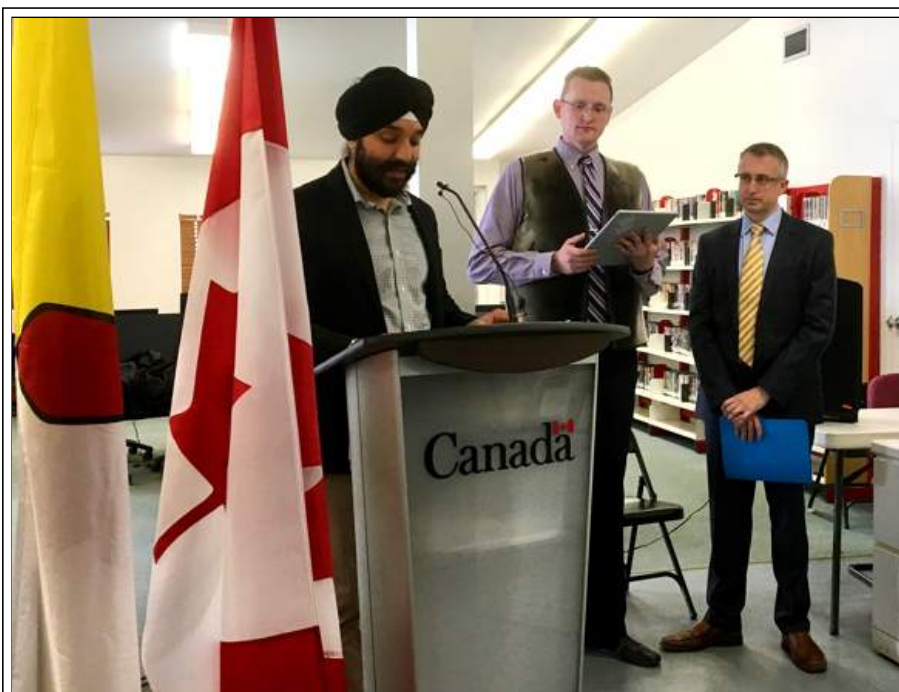
Navdeep Bains, minister of innovation, science and economic development, announces, at the Iqaluit library Sept. 14, that his government will give Northwestel "nearly $50 million" to improve Nunavut internet infrastructure.

The federal government says it will give Northwestel "nearly $50 million" to improve high-speed internet coverage across Nunavut—but don't blame northerners if they roll their eyes at the news.